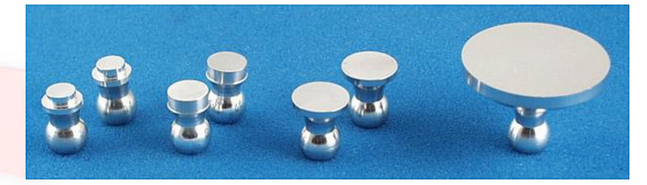
Measurement of Adhesion Strength.doc - Page 2 of 4

The PosiTest AT with optional 50 mm accessory kit is ideal for measuring lower pull-off strengths under 500 psi (3.5 MPa) such as coatings on concrete. The accessory kit includes 50 mm dollies which are standard in most specifications that involve the testing of tensile bond strengths of coatings on concrete. When testing on concrete, typical failures are cohesive within the concrete, not between the coating and the concrete. With proper cutting around the dolly, the instrument can be used to measure the tensile strength of uncoated concrete, as well as concrete repairs.