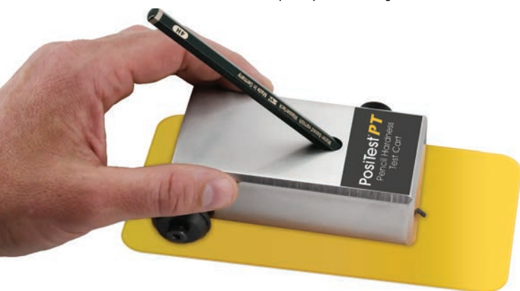
Pencil Cart included with the Complete Kit